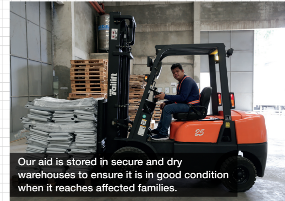
Our aid is stored in secure and dry warehouses to ensure it is in good condition when it reaches affected families.