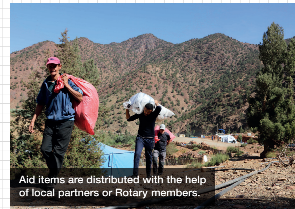
Aid items are distributed with the help of local partners or Rotary members.