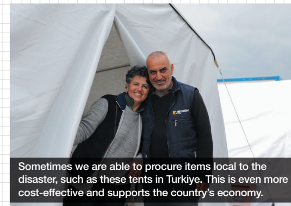
Sometimes we are able to procure items local to the disaster, such as these tents in Türkiye. This is even more cost-effective and supports the country's economy.