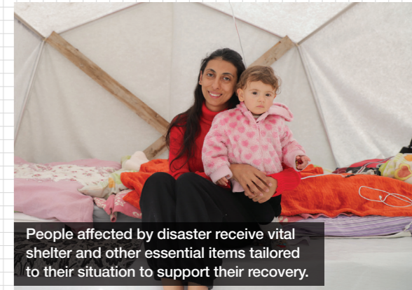
People affected by disaster receive vital shelter and other essential items tailored to their situation to support their recovery.