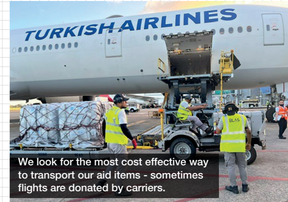
We look for the most cost effective way to transport our aid items - sometimes flights are donated by carriers.