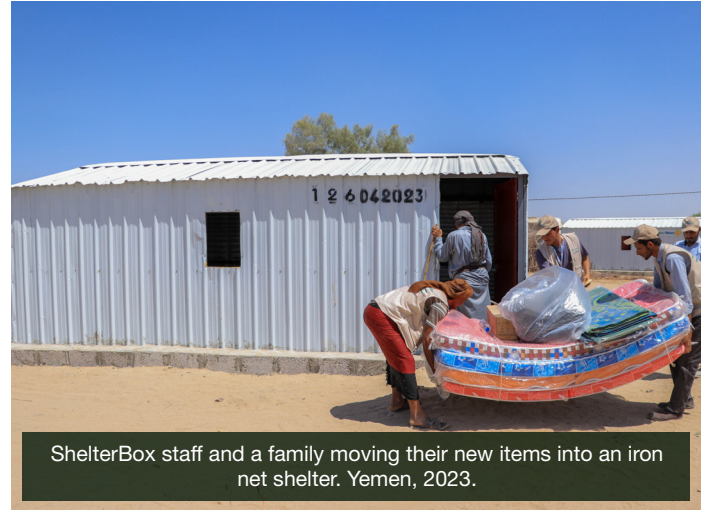
ShelterBox staff and a family moving their new items into an iron net shelter. Yemen, 2023.

So far, we have supported 3,500 people with these new shelters, designed based on the feedback the communities shared with us.