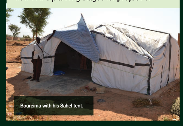
*European Civil Protection and Humanitarian Aid Operations

The construction of a concrete base protects the shelters from flooding and helps to improve levels of hygiene and dignity. The items that form the structure of the Sahel Tents, along with wash kits, cooking pots and water carriers were locally procured. We are now in the planning stages for project 6 .